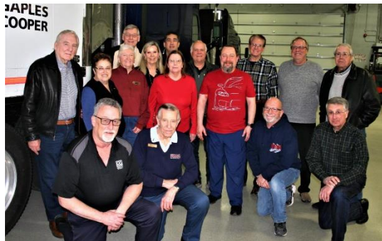
50 to 60 Year Region Members Honored